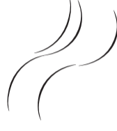
⑲ Napkin at the end of my world (no. 15) , 2021 45 × 45 cm. Serviet, plastik, muslinger, palietter, epoxy og akryl